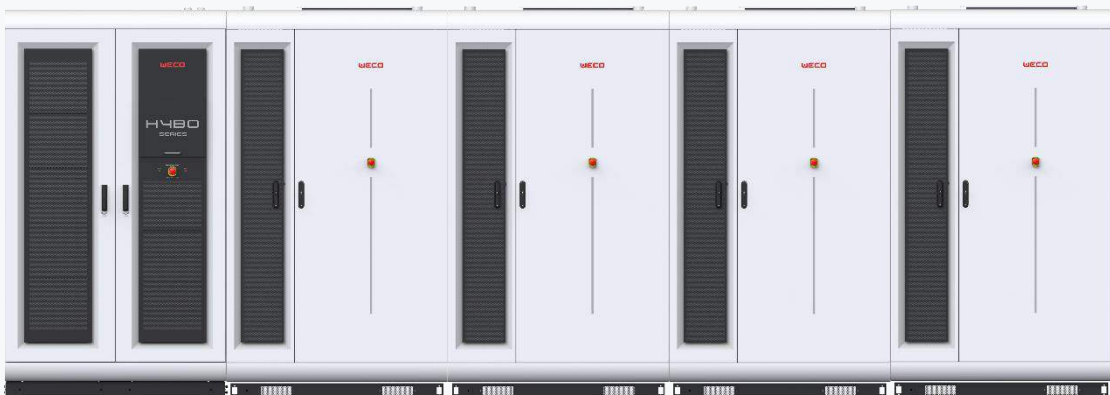
HYBO TL Hybrid Inverter + Multi cabinet Li-Kool system BESS